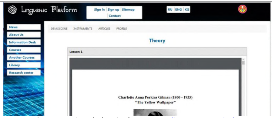
Figure 3. Linguistic Platform www.ling.manas.edu.kg