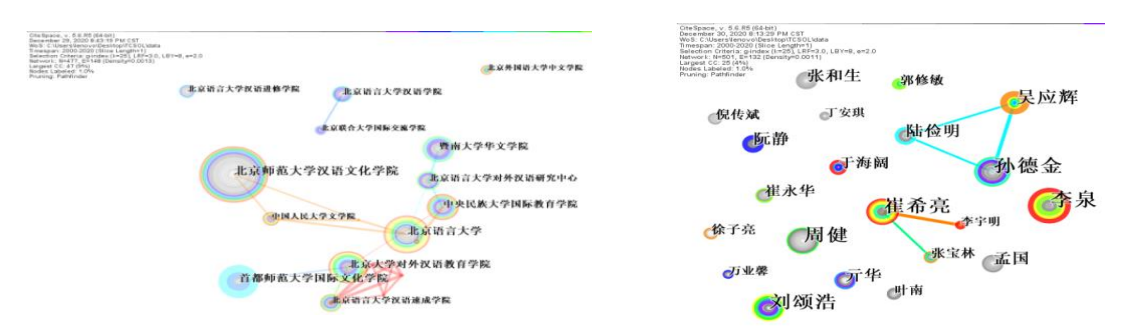
Figure1Distribution of main issuing organizations

The number of papers published by an institution is often proportional to the research ability of the research institution in the related fields. The more papers published, the greater influence of the institution has in this field (Shen Suochao, Bao Liang, 2019). As can be seen from Figure 1, the Chinese Language and Culture College of Beijing Normal University with 58 papers has the largest number of published papers, which indicates that the institute has a great influence in the field of TCSOL. The top 10 institutions are concentrated in Beijing area. It can be seen that universities in Beijing have achieved considerable research results, leading the research direction and trend in this field to a certain extent. As shown in Figure 2, the top three authors are Li Quan with 12 papers, Sun Dejinwith 10and Liu Songhao with 9. There are only two groups of researchers who have obvious cooperative relationship, namely Wu Yinghui, Lu Jianming, Sun Dejin and Cui Xiliang, Zhang Baolin, Li Yuming. Other researchers are "fighting alone".